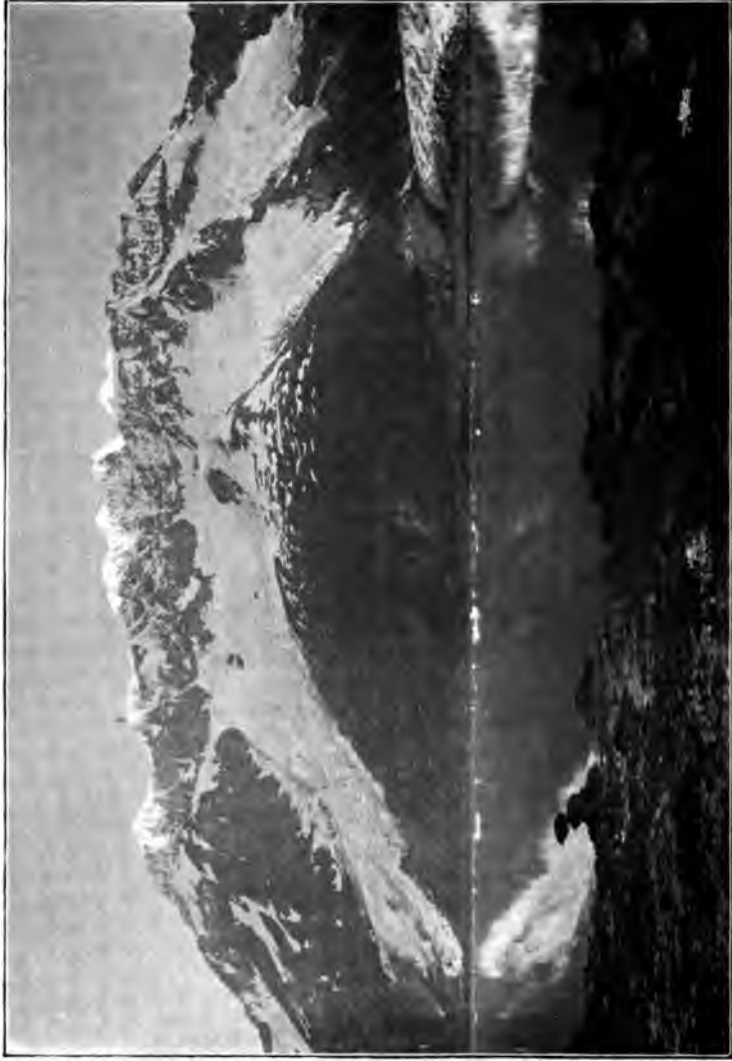
ALPENGLOW ON SUMMIT OF MOUNT MUIR, HARRISON FIOR, PRINCE WILLIAM SOUND